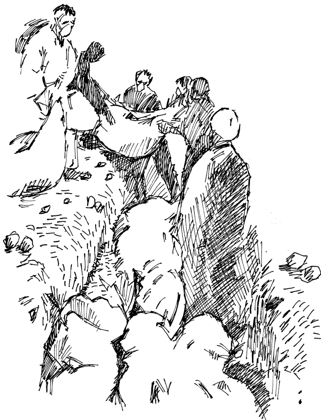
A mass grave

The widespread belief that corpses pose a risk of communicable disease is wrong. Especially if death resulted from trauma, bodies are quite unlikely to cause outbreaks of diseases such as typhoid fever, cholera, or plague, though they may transmit gastroenteritis or food poisoning syndrome to survivors if they contaminate streams, wells, or other water sources.